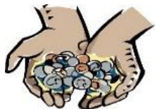
Tithes and offerings

A STEWARDSHIP REMINDER PLEASE REMEMBER: JUST BECAUSE YOU MAY NOT BE AT CHURCH ON A GIVEN SUNDAY, THE LIGHTS ARE STILL ON, THE FURNACE AND AIR CONDITIONERS ARE STILL IN USE, THE CUSTODIAN HAS CLEANED THE CHURCH, AND THE BILLS STILL NEED TO BE PAID. SO, IF YOU HAPPEN TO MISS A SUNDAY (OR THREE OR FOUR SUNDAYS) PLEASE MAKE UP YOUR PLEDGE/OFFERING. THANK YOU!