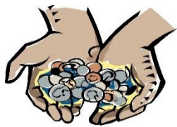
Tithes and offerings

A STEWARDSHIP REMINDER PLEASE REMEMBER : JUST BECAUSE YOU MAY NOT BE AT CHURCH ON A GIVEN SUNDAY, THE LIGHTS ARE STILL ON, THE FURNACE AND AIR CONDITIONERS ARE STILL IN USE, THE CUSTODIAN HAS CLEANED THE CHURCH, AND THE BILLS STILL NEED TO BE PAID. SO, IF YOU HAPPEN TO MISS A SUNDAY (OR THREE OR FOUR SUNDAYS) PLEASE MAKE UP YOUR PLEDGE/OFFERING. THANK YOU!