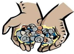
Tithes and offerings

A STEWARDSHIP REMINDER PLEASE REMEMBER: JUST BECAUSE YOU MAY NOT BE AT CHURCH ON A GIVEN SUNDAY, THE LIGHTS ARE STILL ON, THE FURNACE AND AIR CONDITIONERS ARE STILL IN USE, THE CUSTODIAN HAS CLEANED THE CHURCH, AND THE BILLS STILL NEED TO BE PAID. SO, IF YOU HAPPEN TO MISS A SUNDAY (OR THREE OR FOUR SUNDAYS) PLEASE MAKE UP YOUR PLEDGE/OFFERING. THANK YOU!