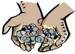
Tithes and offerings

A STEWARDSHIP REMINDER PLEASE REMEMBER: JUST BECAUSE YOU MAY NOT BE AT CHURCH ON A GIVEN SUNDAY, THE LIGHTS ARE STILL ON, THE FURNACE AND AIR CONDITIONERS ARE STILL IN USE, THE CUSTODIAN HAS CLEANED THE CHURCH, AND THE BILLS STILL NEED TO BE PAID. SO, IF YOU HAPPEN TO MISS A SUNDAY (OR THREE OR FOUR SUNDAYS) PLEASE MAKE UP YOUR PLEDGE/OFFERING. THANK YOU!